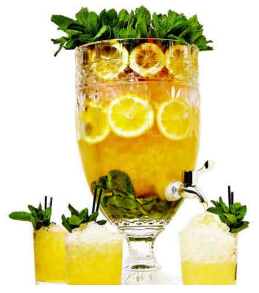
Bobby Daugherty, NY Magazine

Sharable punches: Your parents' preference for communal boozing is back. Now liberated mixologists in fancy places are concocting large-format punches that serve from multitudes of guests ... with no limits on pricing or ingredients. At Rickhouse in San Fran, fifty bucks get you a punchbowl of 8-year-old rum, lemon juice, Peychaud's bitters, ginger beer and amaro CioCiaro (see Herbal Liqueurs, below). At Montreal's bar called Big in Japan you get seasonally changing punch for $65 ... like one with gin, Pimm's, mint, lemon and pomegranate. The ultimate, at NY's NoMad Bar, comes in a spigot jar with a